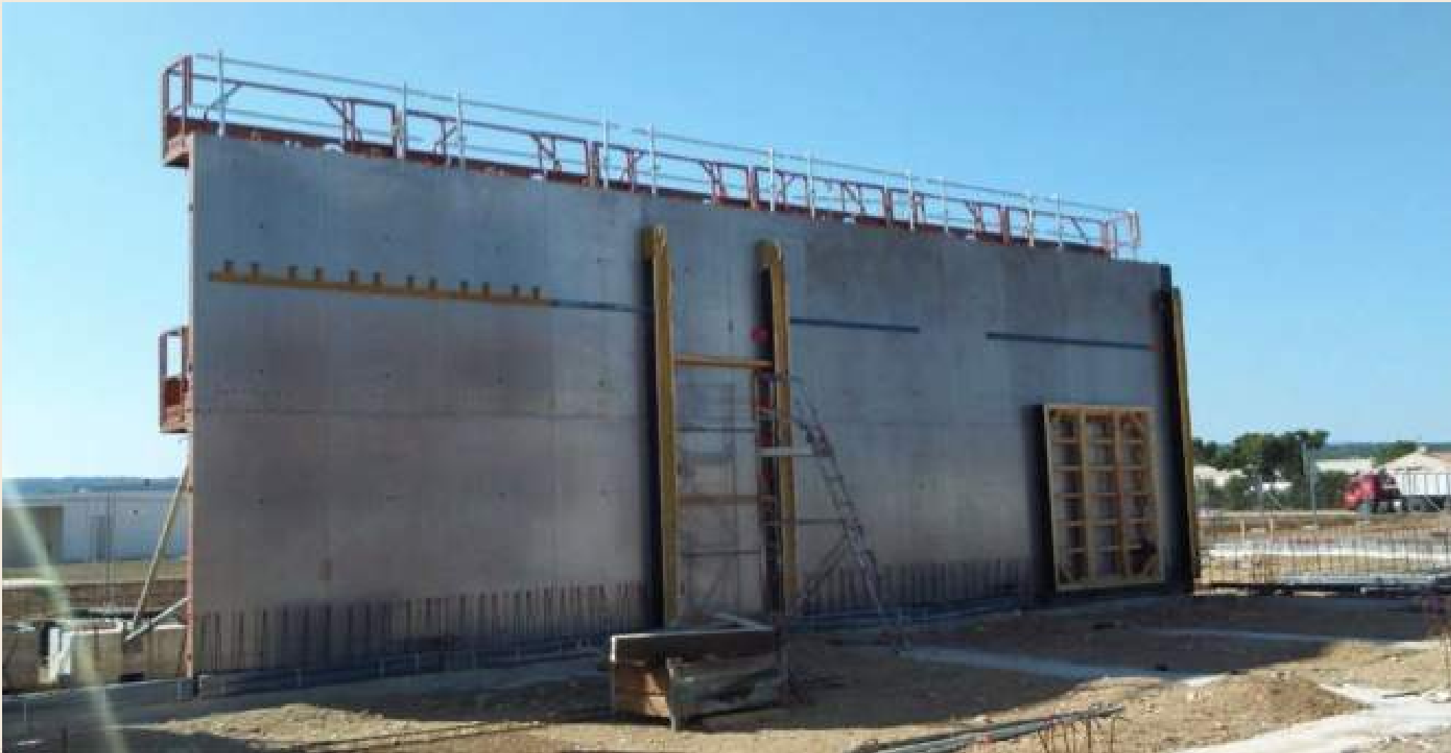
Exhibit of on site Wallform technology